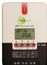
MPPT Solar Charge Controller