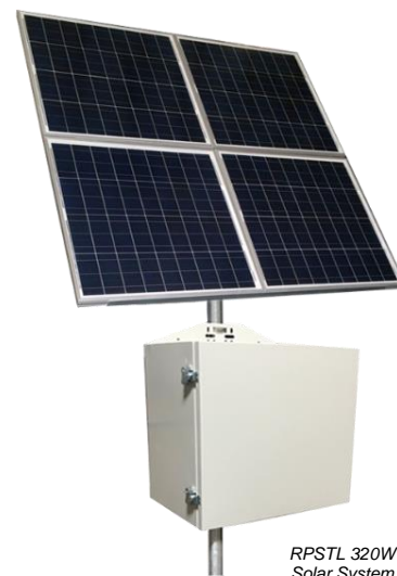
RPSTL 320W Solar System