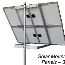
Solar Mount with 4 Panels - 320W