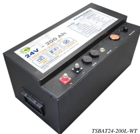
TSBAT24-200L-WT Wide Temp Lithium Battery